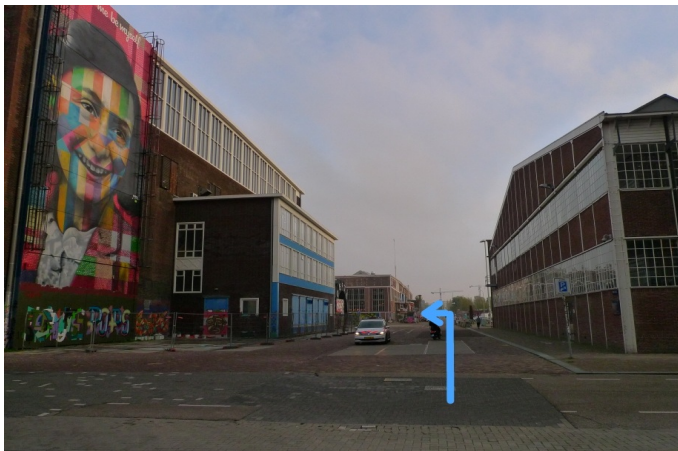
3. continue to the 2 nd hall at the left