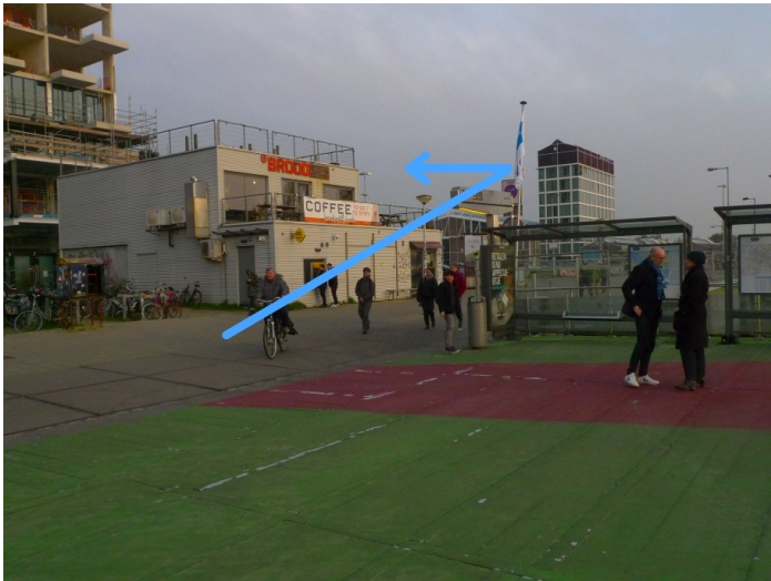
1. From the ferry walk to the right then turn left at the road.