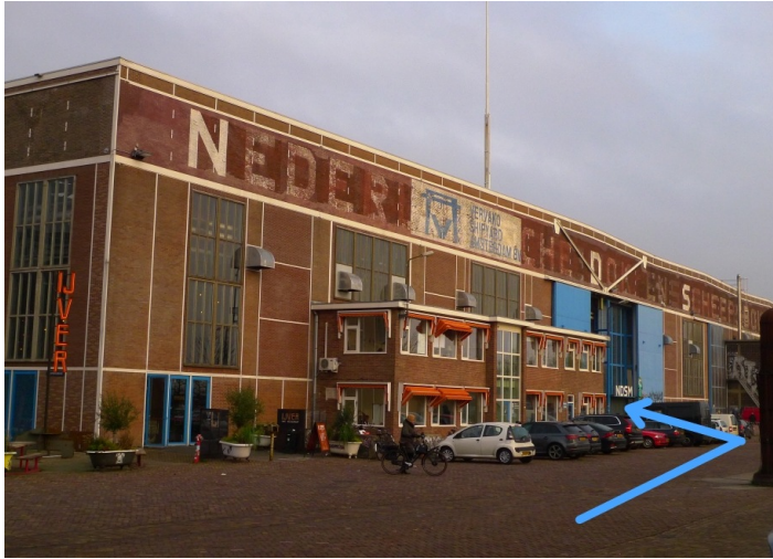
4. Here it is, behind the large blue doors. You can grab coffee or lunch at the corner cafe "IJver"