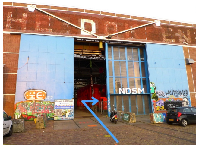
5 jDo enter here. When the large door is closed you can use the smaller doors.