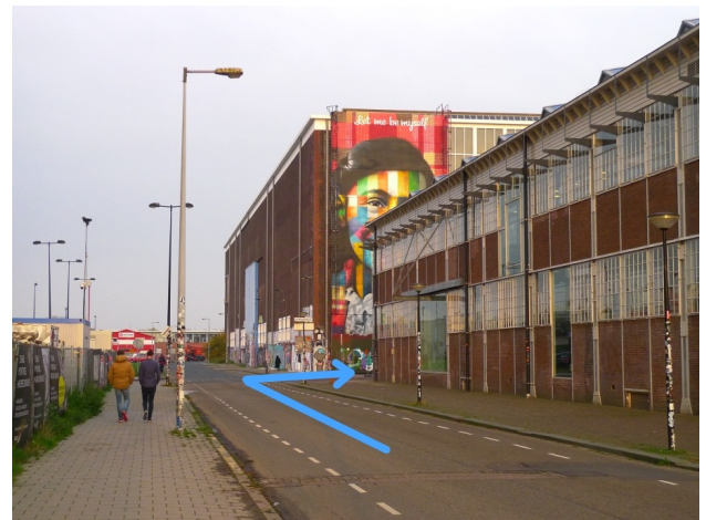
2. At the Anne Frank mural turn right into NDSM-plein.