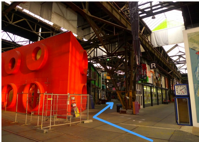
6 Turn right at the small red building, it looks like a Lego brick.